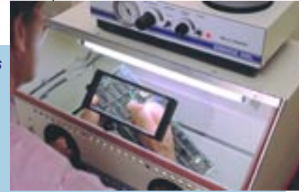
ESD Control with optional magnifier

WS2200-3 115V/60Hz, 120 Watt, 60 lbs. (27 kg.) WS2200-4 230V/50Hz, 100 Watt, 60 lbs. (27 kg.) Dimensions: 24" Wide x 15" Deep x 12" High Interior Space: 23" Wide x 12" Deep x 9" High (approx.) Window: Tempered glass opening 23" x 6 1/2" Lighting: Dual 15 Watt cool white fluorescent lamps, F15T8/CW