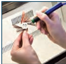
Epoxy removal from probe rings