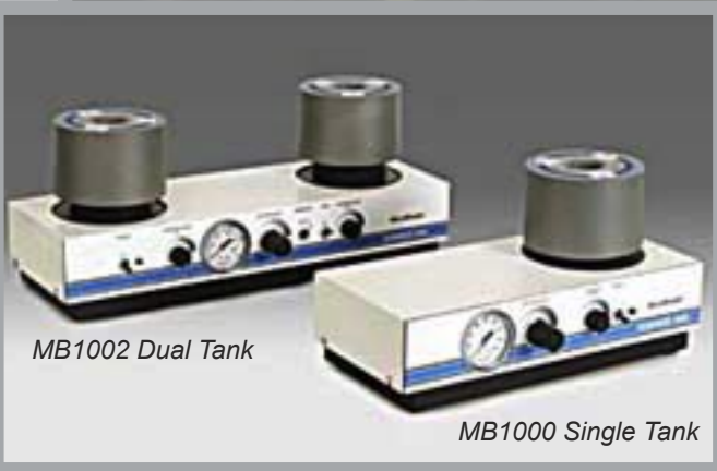
MB1002 Dual Tank