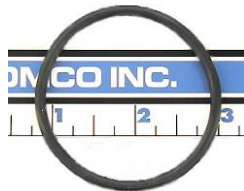
ST5624 – O-ring (1) (2.00ID x .139THK)