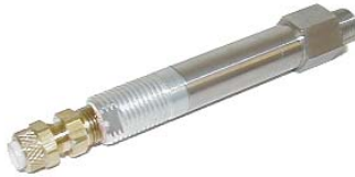
MB1301-2 – Modulator Housing Assembly (1)