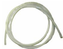
ST4012 – 1/4" Nylon Tube (3 feet)