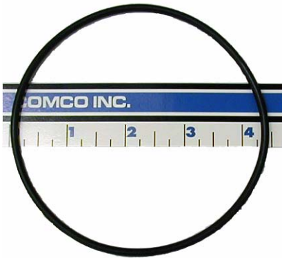
ST5022 – O-ring (1) (4.109ID x .139THK)