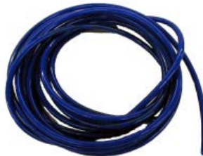
MB1233 – 1/4" Abrasive Tube (6 feet)