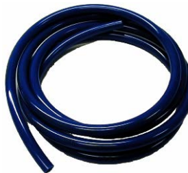
PF2083 – 3/8" Abrasive Tube (8 feet)