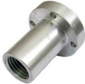
PF2189-2 – PowderGate Valve Seat Assembly (1)