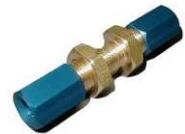
ST4014 – 1/4" T Bulkhead Union (1) with MB1483 Quicknuts installed