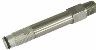
PF2040 – Modulator Housing Assembly (1)